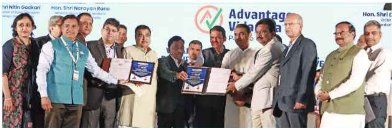
(MoU signed between AAR Indamer Aviation Pvt. Ltd. And Priyadarshini Collage of Engineering, Nagpur & Jhulelal Institute of Technology, Nagpur)