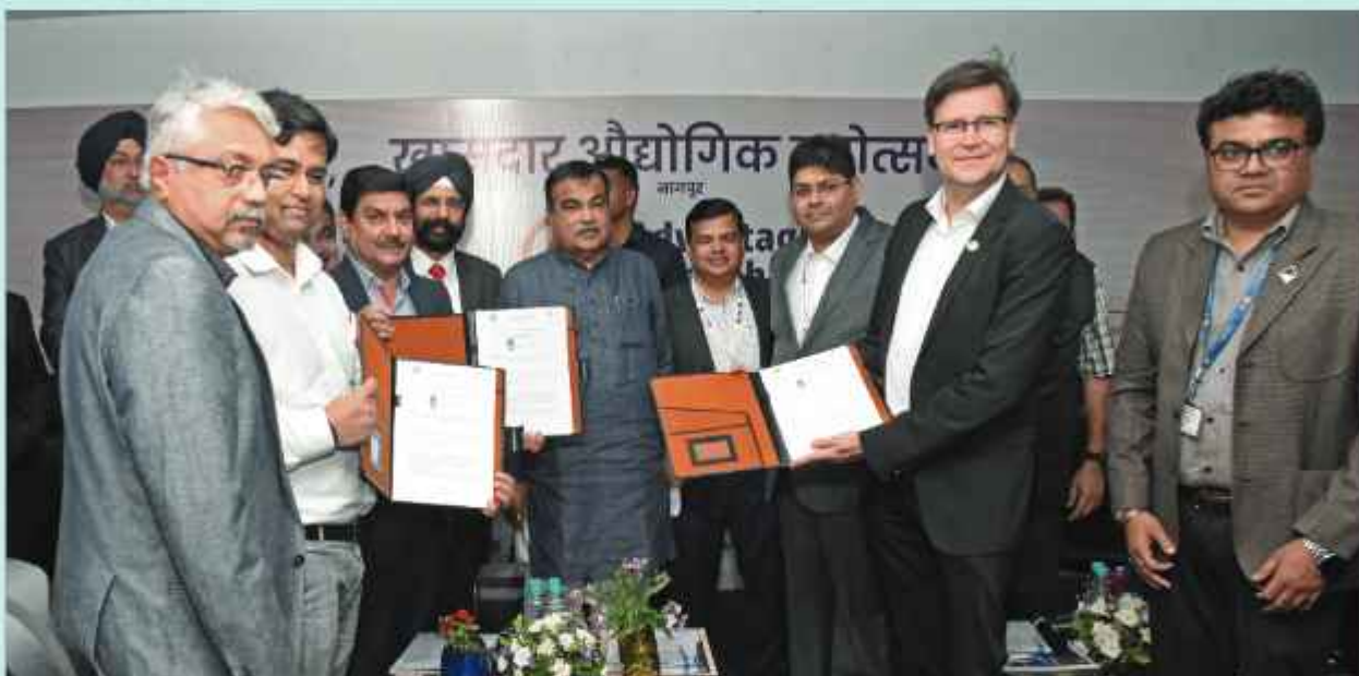
(Sr. Officials of Keystonemab and MADC Exchanging documents after signing of MOU.)

MOU: Maharashtra Airport Development Company Limited (MADC) and Netherlands-based Keystonemab, entered into a significant industrial agreement at the Khasdar Audyogik Mahotsav Advantage Vidarbha to initiate a project worth Rs 200 crore in MIHAN-SEZ.