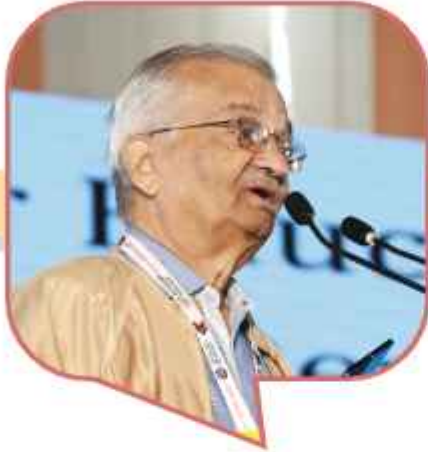
Dr. Anil Kakodkar